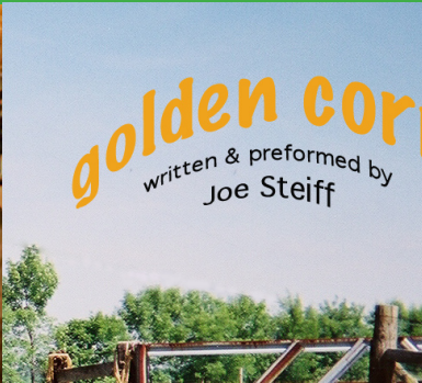
The Golden Corral (Joe Steiff, USA)

A family riven by homophobia in Robert Mugabe’s Zimbabwe sees its power relationships crumble when one brother contracts HIV. Stigma, homophobia, dependency and HIV combine to make a gripping drama. Direct from Harare for its European premiere in Dublin – not to be missed! “The play to watch, it will stir your emotions and make you chuckle aloud... hilarious yet touching... certainly a great show” HIFA-LUTIN... “tackled homosexuality, promiscuity and partisan politics with a remarkable flow and fluency... refreshing in the lighting effects, the stage arrangement and blending of the two man cast that had the audience hugging and praising the actors” THE STANDARD