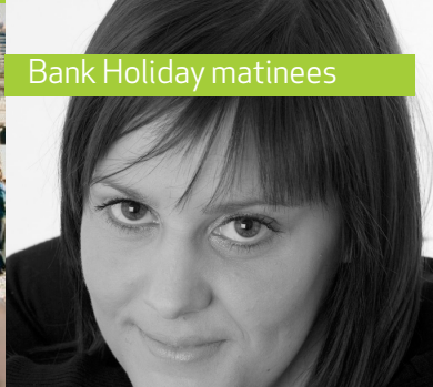
And Then There Was Me (Three Wise Women Productions, Ireland)