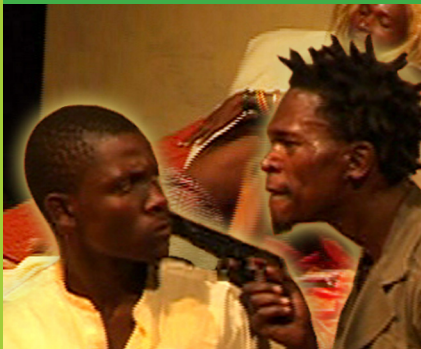
Loupe (Imdlalo Productions, Zimbabwe)

Venue: Theatre @ Outhouse /105 Capel Street Dublin 1